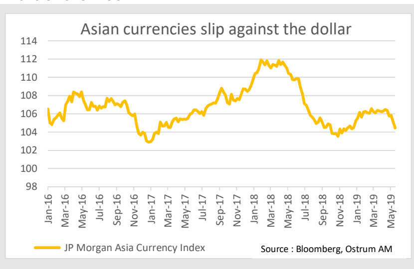
Chart of the week

The China-US trade conflict is ongoing. The implementation of tariffs on Chinese goods imports sparked currency realignment in.